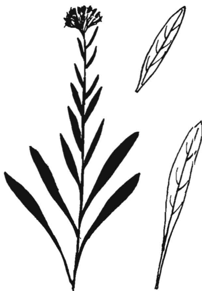
16. Ohio Goldenrod