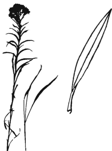
14. Riddell's Goldenrod