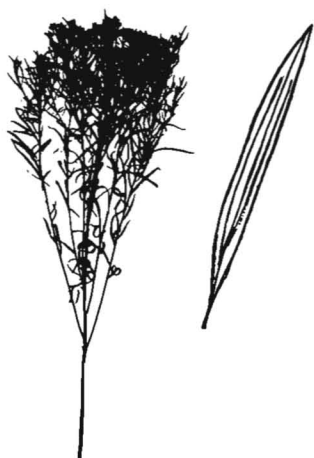
13. Grass-leaved Goldenrod