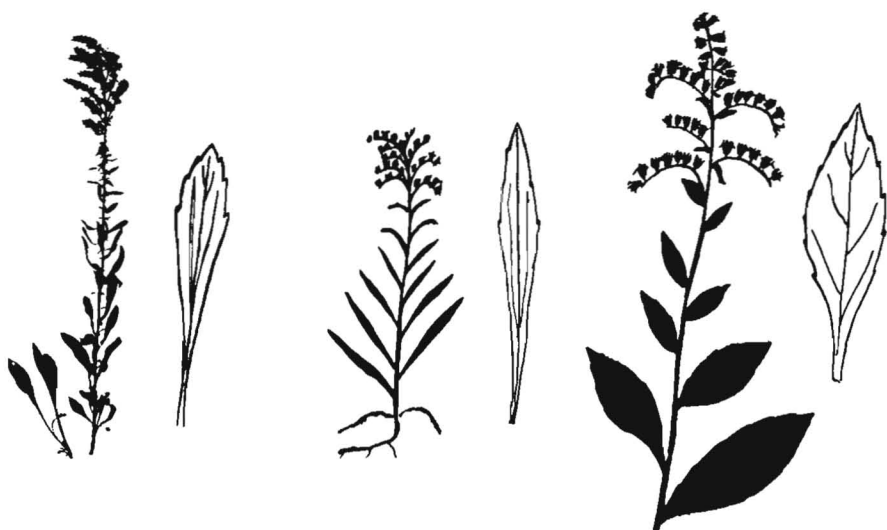
8. Old Field Goldenrod 9. Missouri Goldenrod 10. Roughleaved Goldenrod