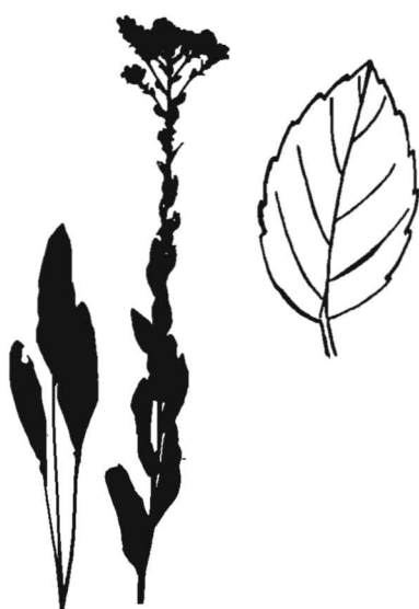
15. Rigid Goldenrod