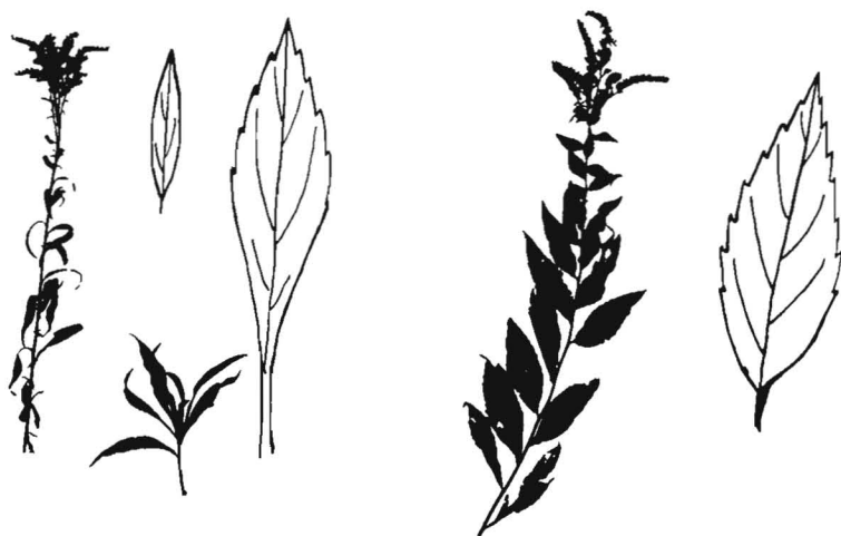
11. Early Goldenrod