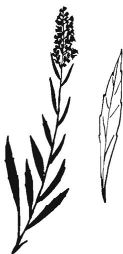
5. Swamp Goldenrod