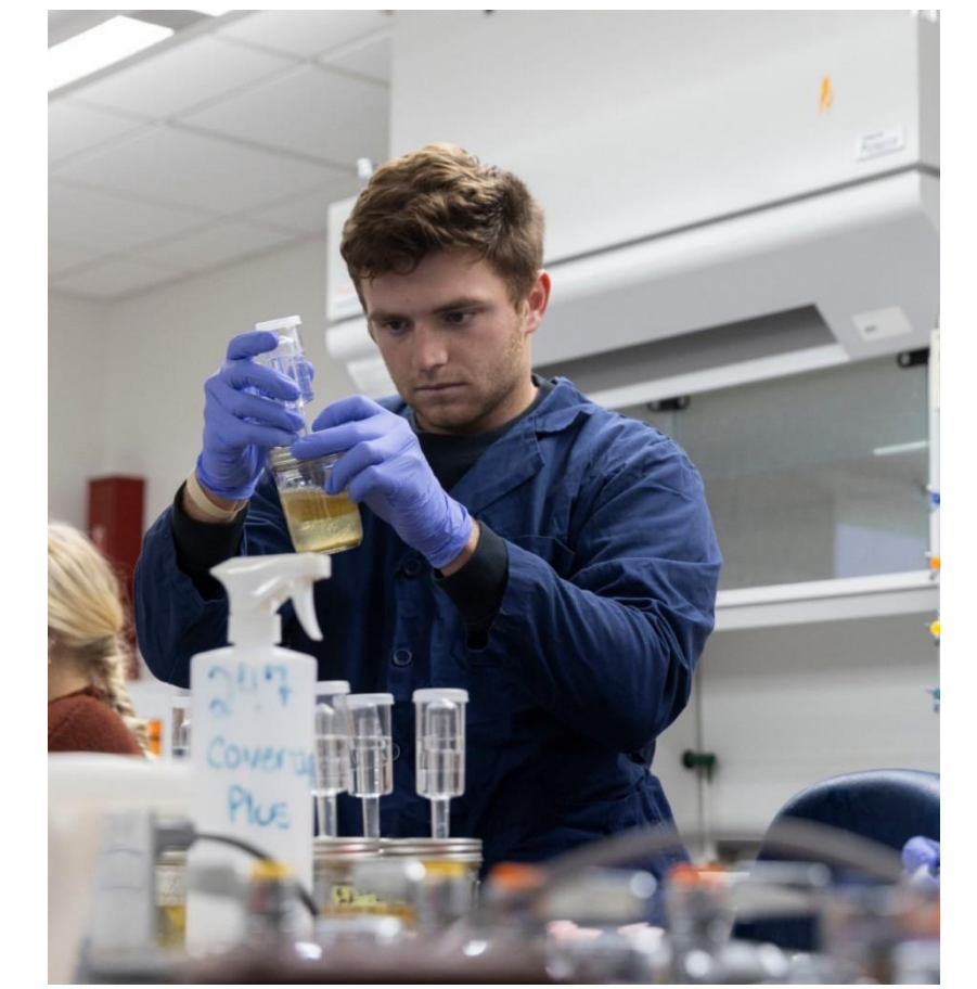
Figure 2. Samples collection from treatment jars