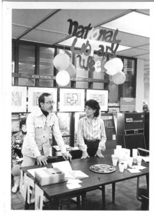
1 - Photo: National Library week at UW-Stout Library, 1979...42 years ago!