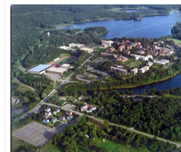
Saint John's Abbey, Collegeville, MN