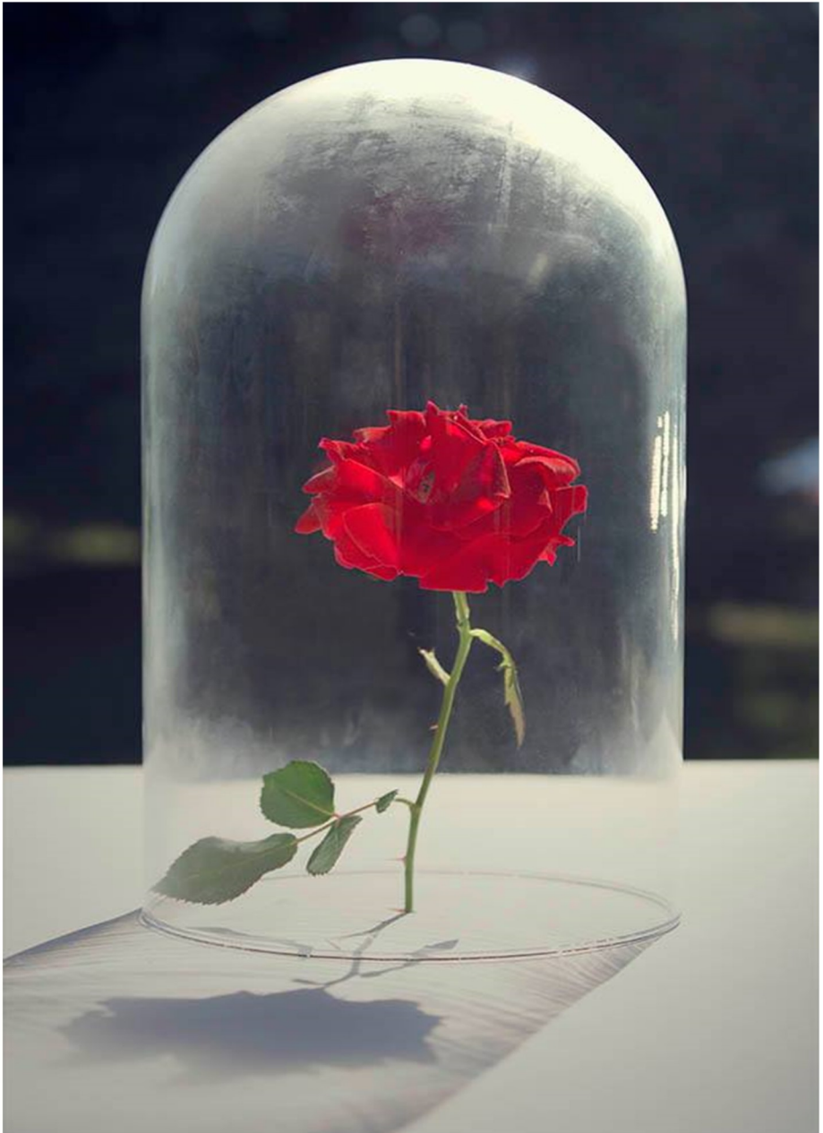
Photograph by Leah Greenwood