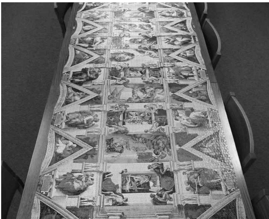
Pictured above is an 8,000 piece puzzle completed by students and staff at McIntyre Library.