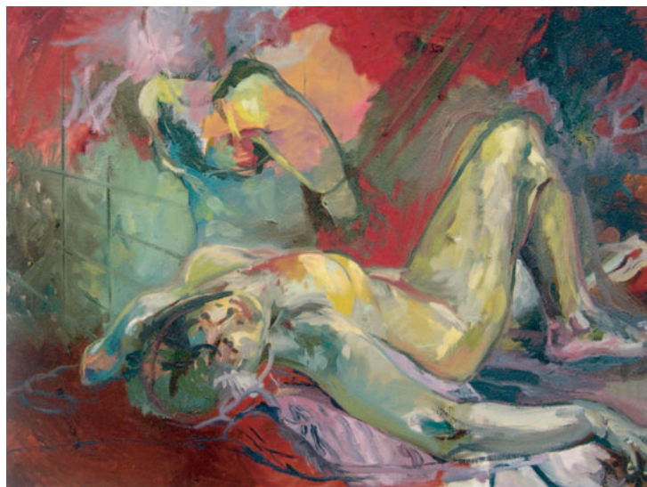
Melissa Steckbauer, Tie Me Up, Tie Me Down , mixed media, 2004