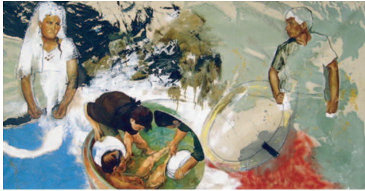
Melissa Steckbauer, Theirs , mixed media, 2004