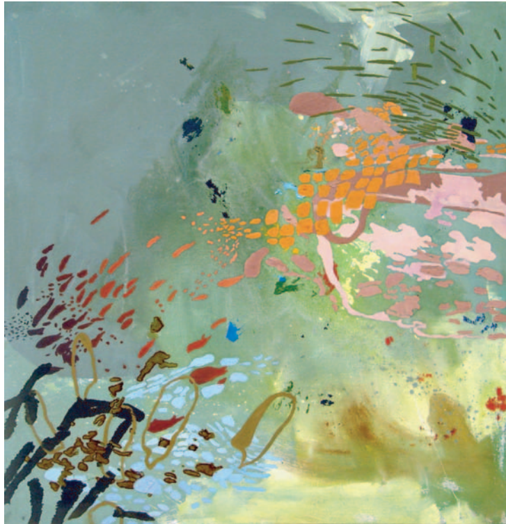
Melissa Steckbauer, Perfect Pitch , mixed media, 2004