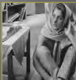
Q = 0.48

The following two images are the results of compressing "Barb" at a ratio of 1:100. ASWDR receives a higher IQI and noticeably retains key features of the original image better, for instance the facial features.