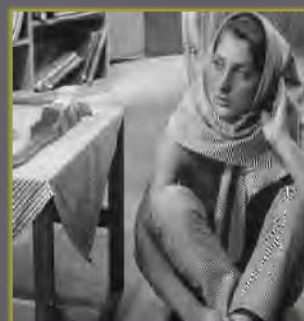
Q = 0.50