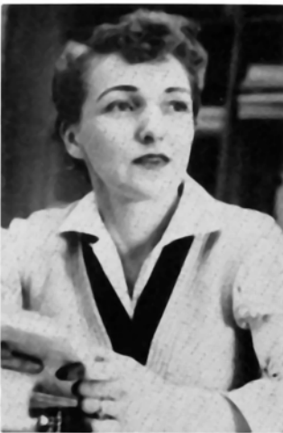
Audrey Adams Library