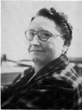
Opal Knox Education