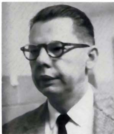
William Abbott Music