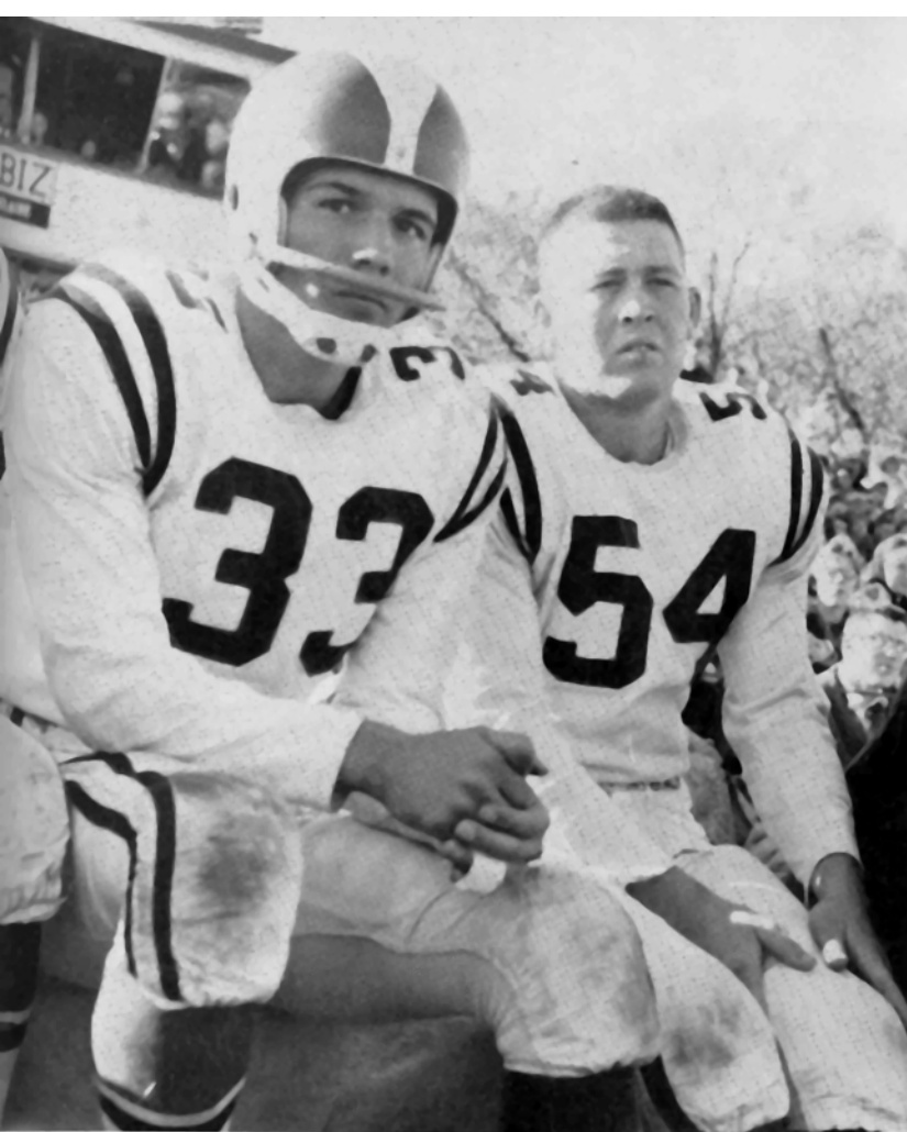
The scoreboard tallied a Falcon defeat