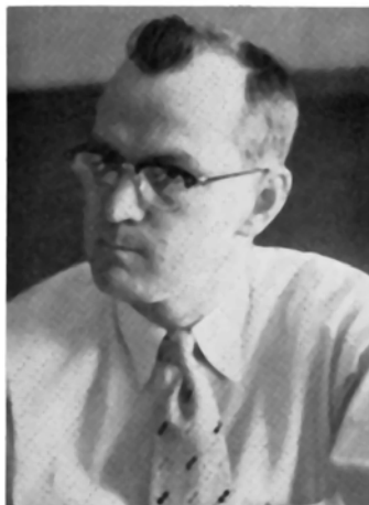
Wilfred Harris Psychology