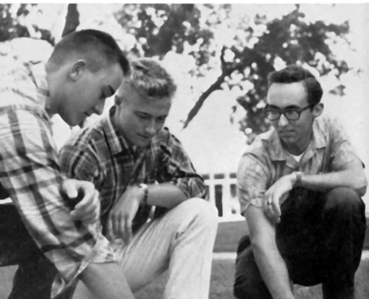
Three leading "organization men"