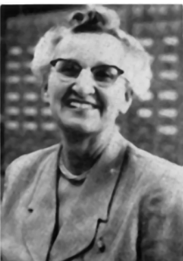
Amy Fuller Library