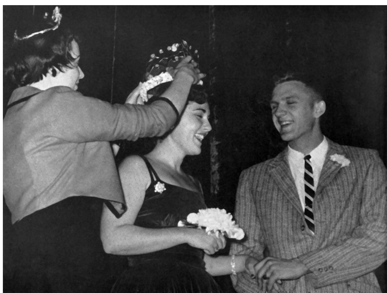
The sparkle of Queen Shirley's eyes