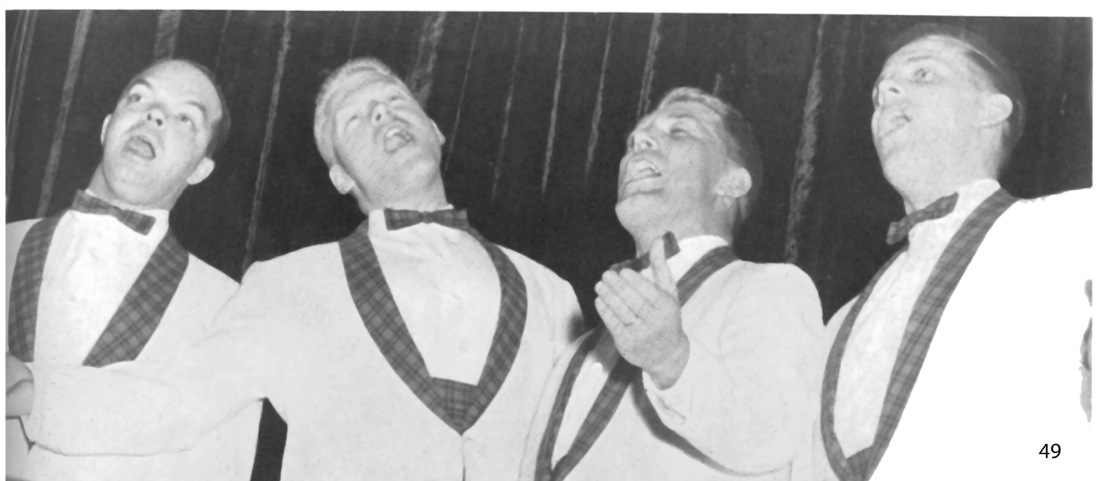
Our favorite barbership quartet