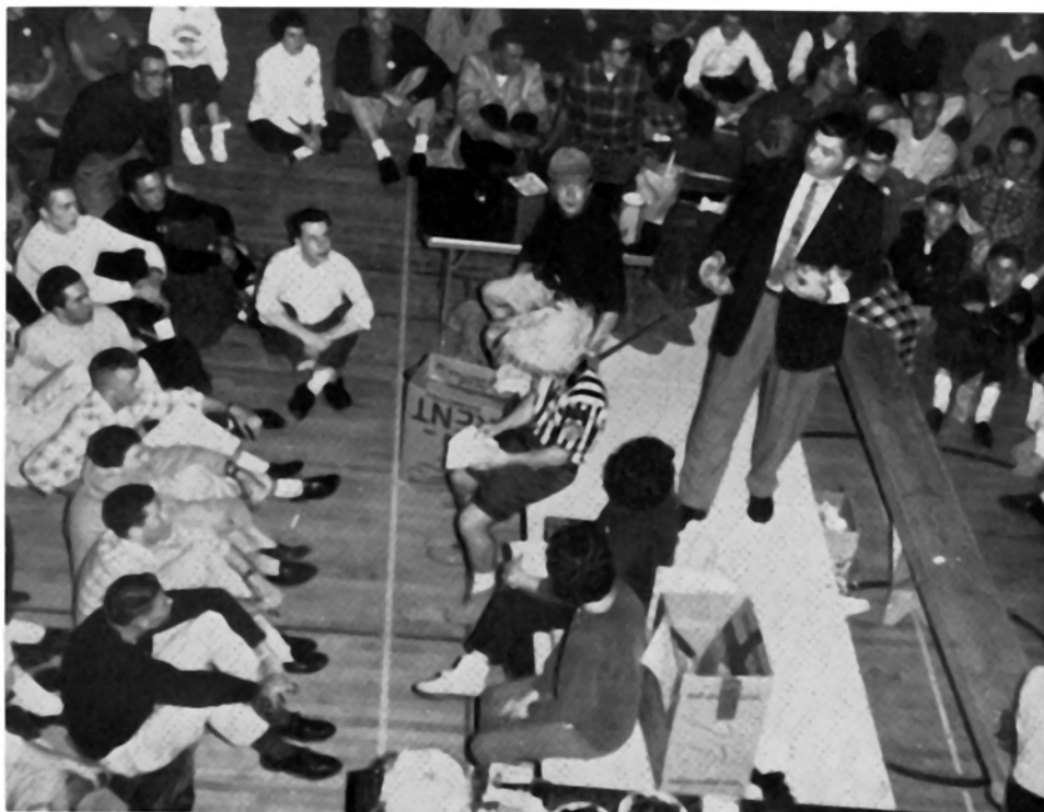
The last pizza pie was sold