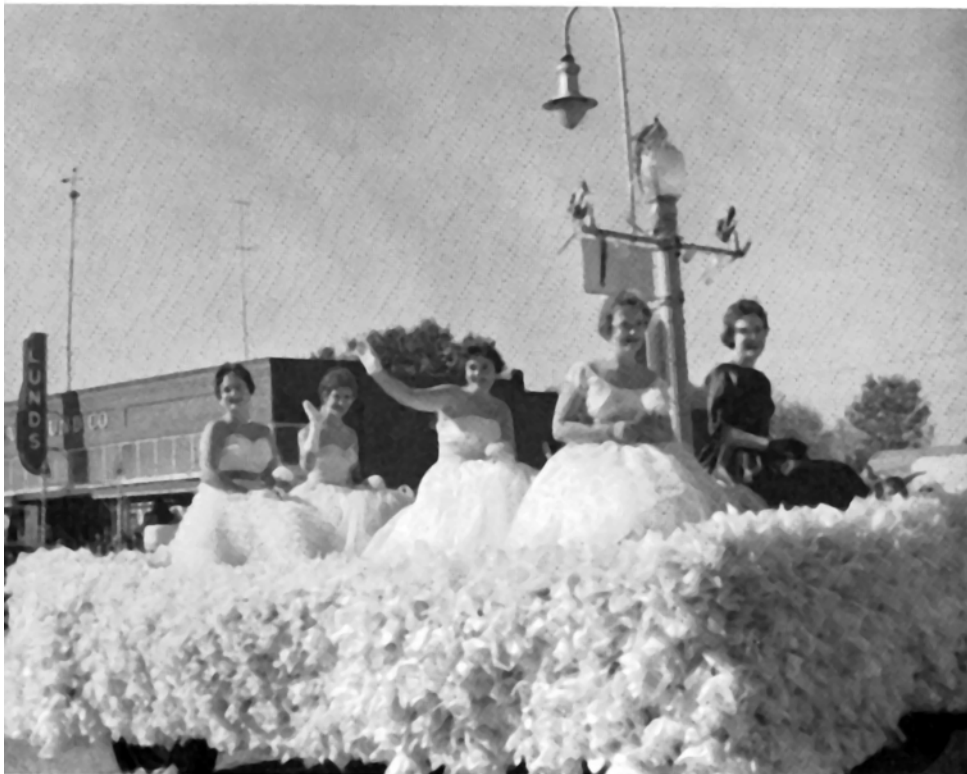
Parade of floats