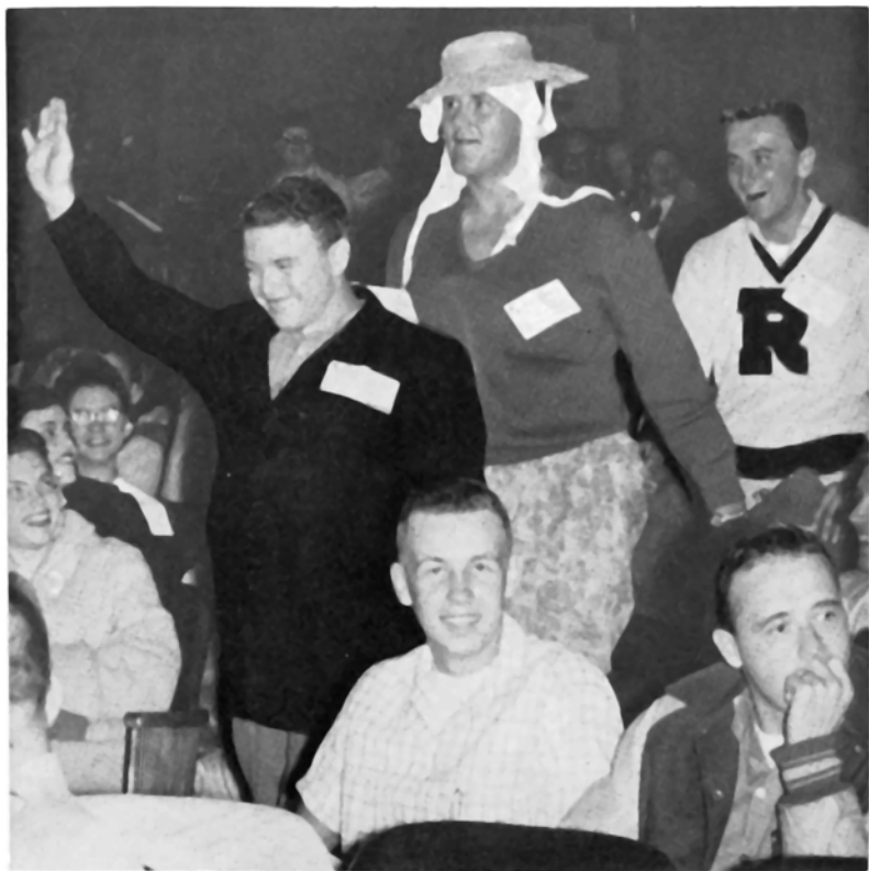
Sponsors campaigned with vigor