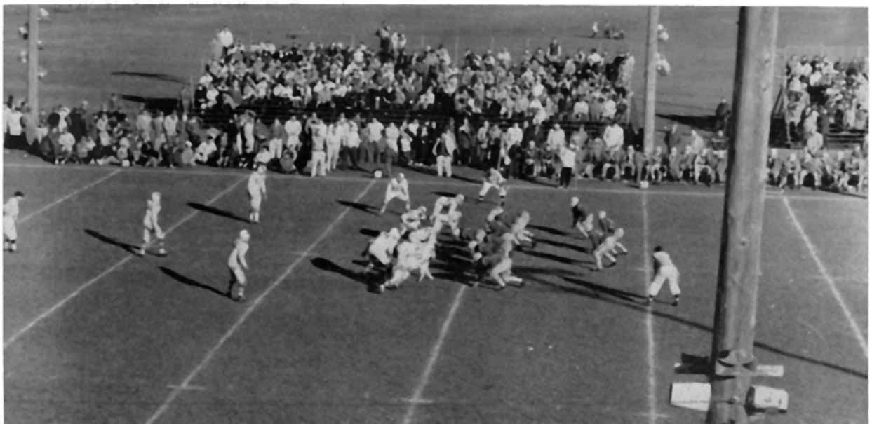
The "Big Red" fought hard