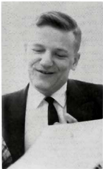
Clifford Fortin Library