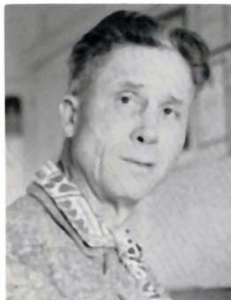
Chauncey King Music