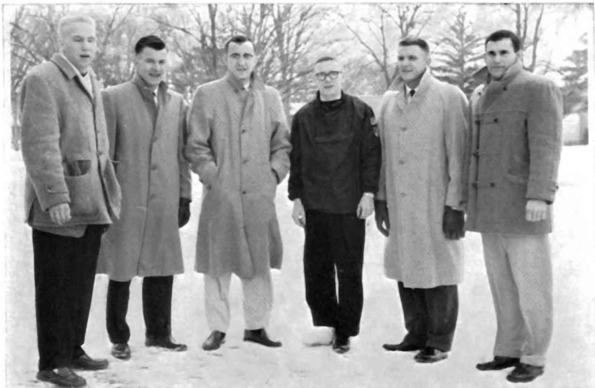
King candidates were enthusiastic