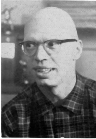
Don Page Physical Education