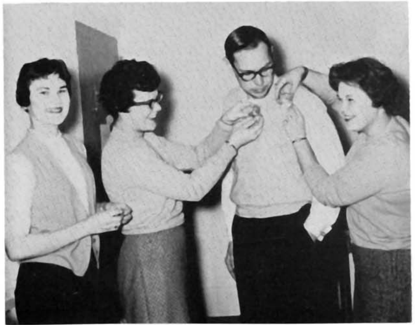
Three leading ladies

Some arose early Saturday morning to bowl in the mixed-doubles tournament and string crepe paper for the midway that afternoon. Others spent a lazy day preparing for the climaxing basketball game and dance.