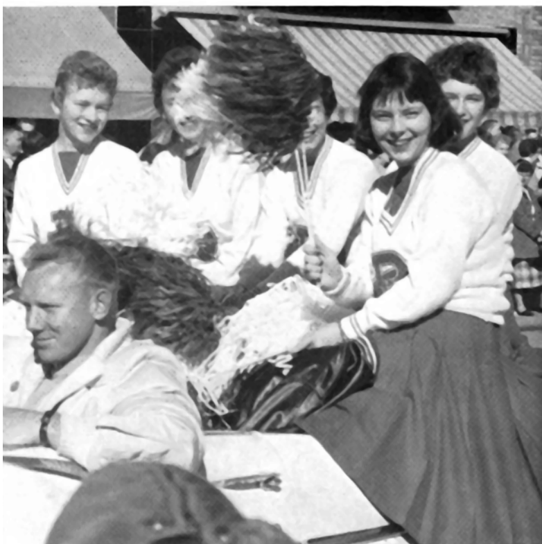
Cheerleaders shouted en masse