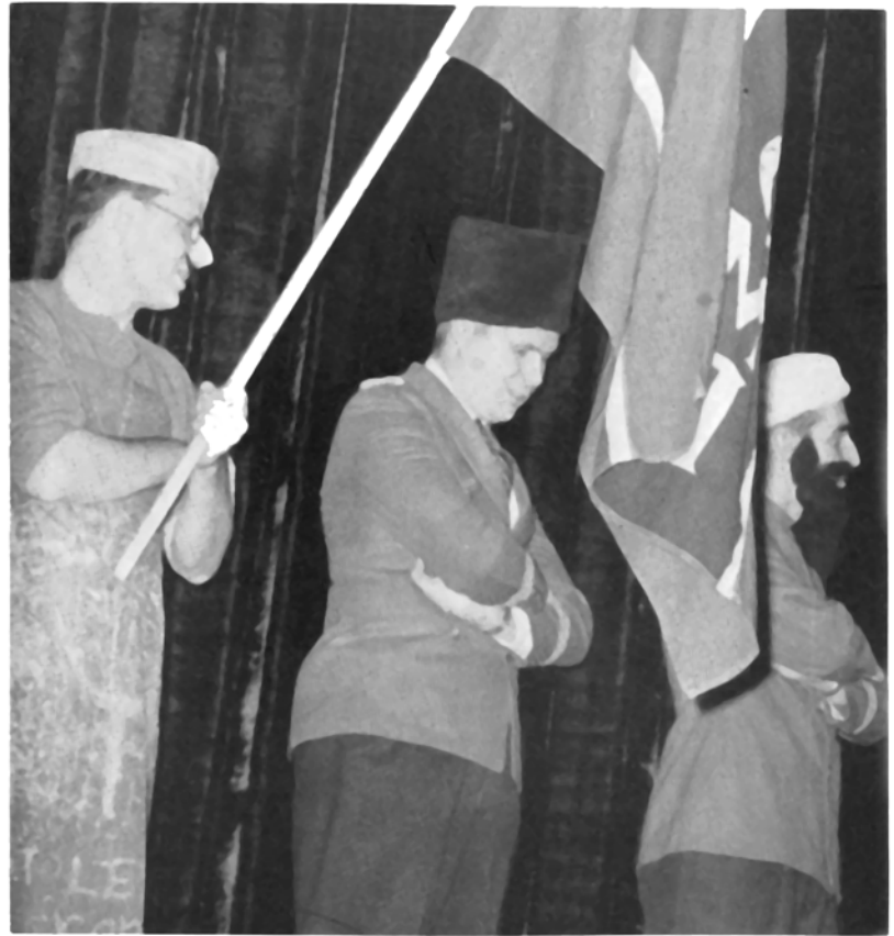
The pros complemented the mood

We spent the late afternoon greeting old friends at coffee hours, and some even managed to sneak a nap before an evening of dining and dancing. As the orchestra played "Good-night Ladies," students left the decorated gymnasium to return to their rooms with tired feet and happy hearts and fond memories.