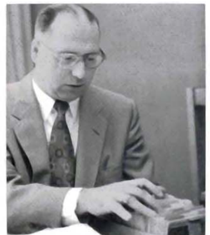
Richard Cooklock Library