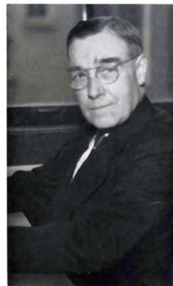
A. N. Johnson Agriculture