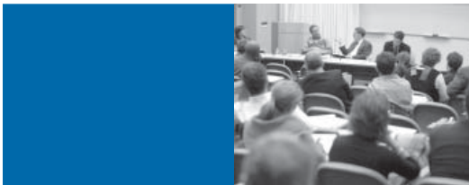
Discussion during faculty-proposed conference "Art of the State," October 2005.

A proposal may come from up to three principal organizers (POs), with one of them serving as the main contact. One of the POs must hold a ladder-rank (assistant, associate, or full professor) position in the College of Letters and Science at UWM; all must be UWM faculty or academic staff. The POs are welcome to submit a proposal on behalf of a larger group that may include academic staff, graduate students, and community members. For complete information, please click on the link on the left-hand side of the Center homepage, http://www.uwm.edu/Dept/21st/ .