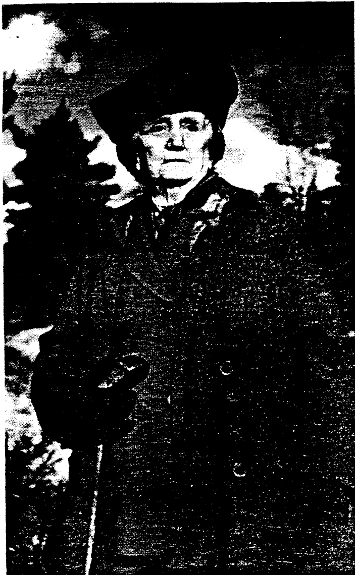
Ethel Smyth, composer. See CALLING THE TUNE, page 38.