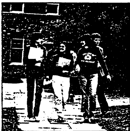
Students at the College of New Rochelle