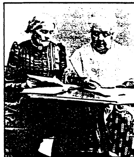
Susan B. Anthony and Elizabeth Cady Stanton