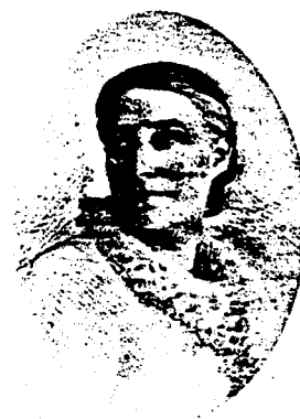
Elizabeth Stuart Phelps