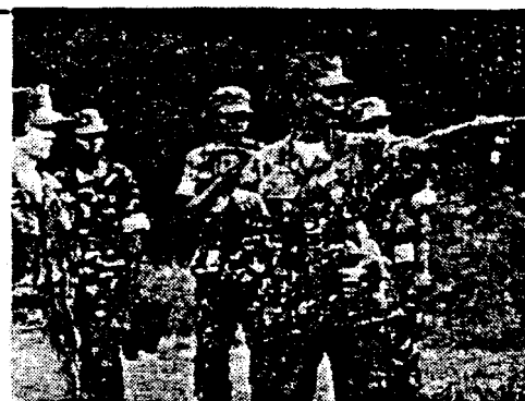
Women in the military see page 14