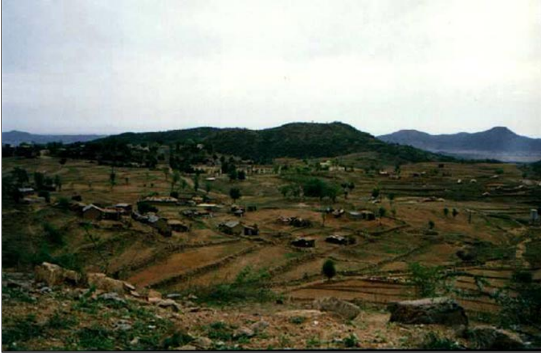
A view of the fields outside Dongollo Tahatai, at the eastern border of the Eritrean highland

Leasehold, which is reserved for investments and large public services, is available to both Eritrean nationals and foreigners, though the latter need specific permission granted by the president of the state. The immediate effect of that rule, however, was to curb the legal capacity of Eritreans living abroad in countries that had adopted the principle of reciprocity. That is, since foreigners living in Eritrea no longer had a legal capacity to own real estate (except with presidential permission), the same capacity was automatically denied to Eritrean nationals living abroad.