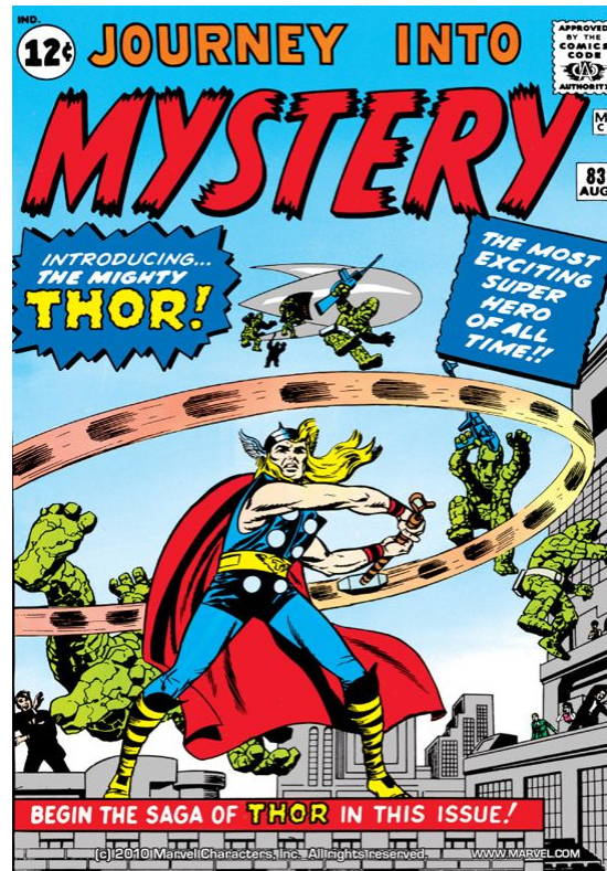
Figure 3: Journey into Mystery #83, © and TM Marvel and Subs. Used with permission.

In August 1962 Marvel comics released Journey into Mystery #83 which featured a new superhero, Thor the Norse god of thunder. The girdled hammer-wielding champion of Asgard was back. In the issue Dr. Donald Blake, a young frail American doctor on vacation in Norway, overhears a local talking about giant monsters in the woods. Intrigued Blake decided to check it out and runs across the stone men of Saturn. Trying to escape Blake runs into a cavern and finds a stave of wood on the ground. While trying to use the stave to pry a bolder that obstructs his path, the piece of wood strikes the ground and Blake instantly transforms into Thor! The cane transforms into a