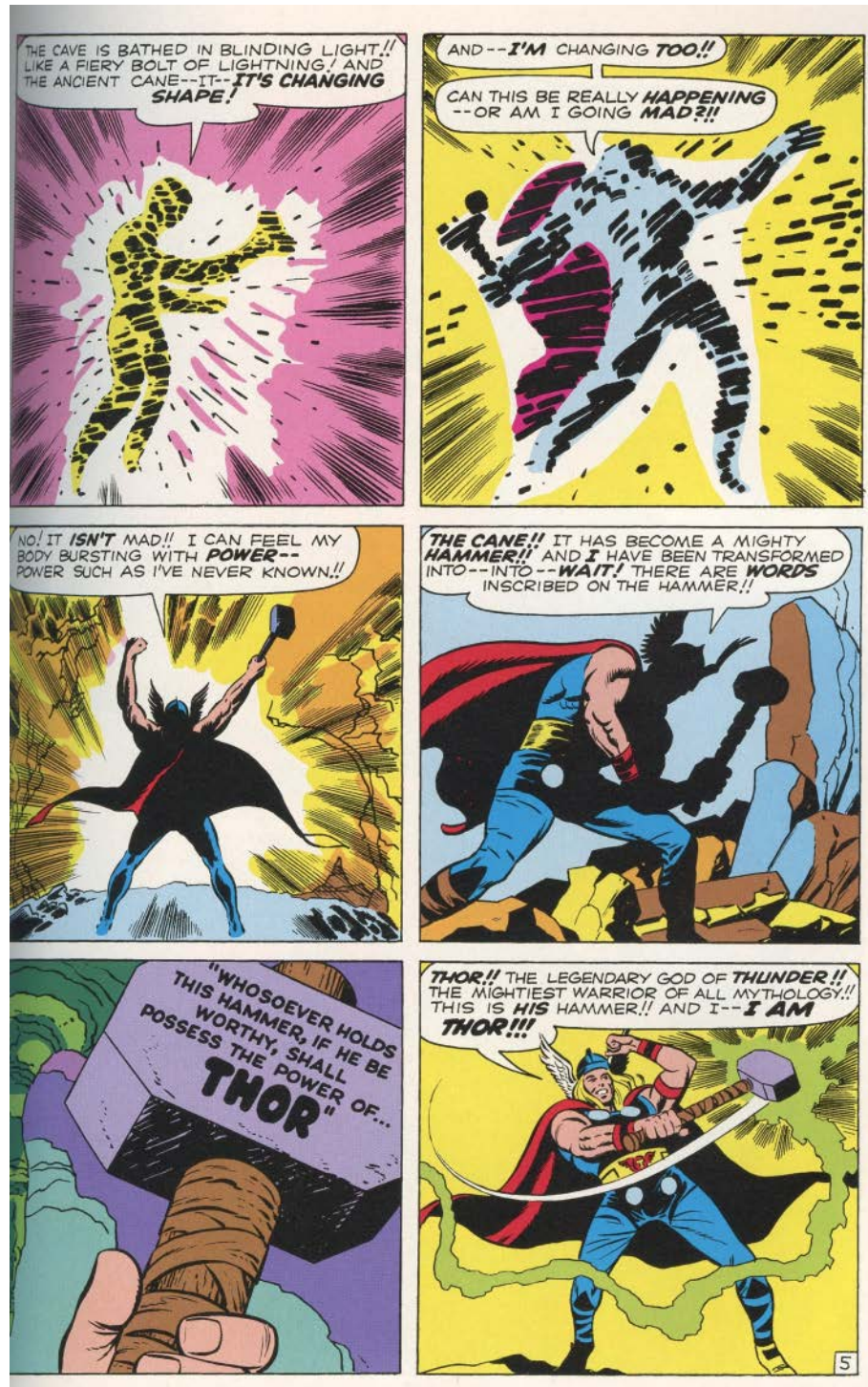
Figure 4: Journey into Mystery 88

hammer. Thor then wipes the floor with the alien invaders and saves the day! How did Thor get here? Why is he here? What does this mean?