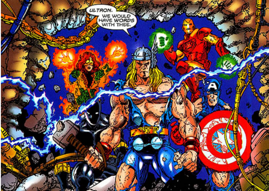
Figure 6: Avengers Vol. 3 #22© and TM Marvel and Subs. Used with permission.

The assumed defeated avengers led by Thor come to the aid of their comrades and Ultron is then defeated and we all live happily ever after, or at least until lest issue. 65