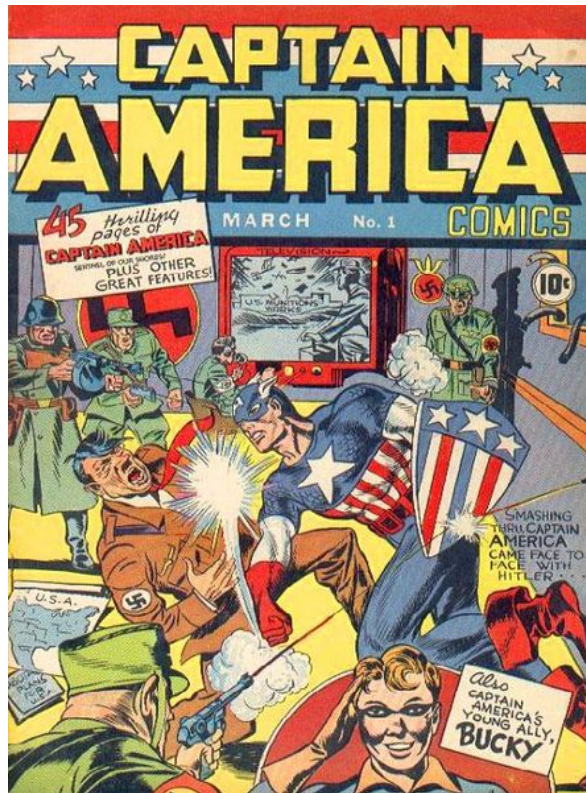
Figure 2 Captain America First Issue cover © and TM Marvel and Subs. Used with permission.

The cover of the very first issue Cap is giving Hitler a good old American haymaker. Nine months later when the US actually joined the war, the industry dropped this subtlety and went into full war mode. Comics were shipped overseas and provided soldiers with light escapist entertainment. On the home front comic book characters did their part for the war effort as well. During this time if you were a superhero you fought and killed Nazis, but the responsibilities of supers didn't stop there. Superman advocated for the Red Cross, Batman sold war bonds, and Cap taught us to save paper and metal for the war effort. 31