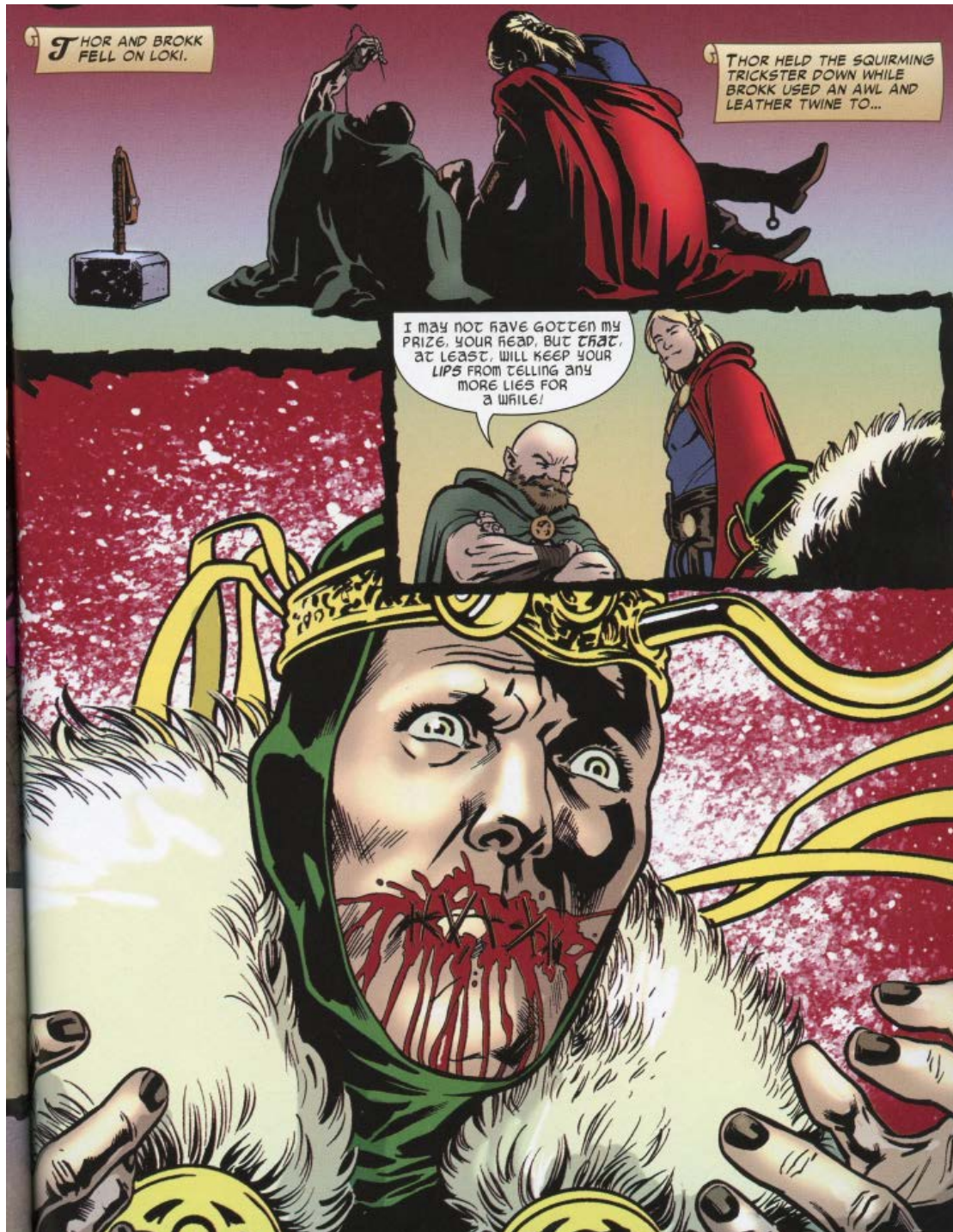
Figure 8 and 9: Trial of Loki © and TM Marvel and Subs. Used with permission.