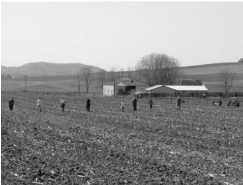
Public Field Survey on the Trocinski fields.