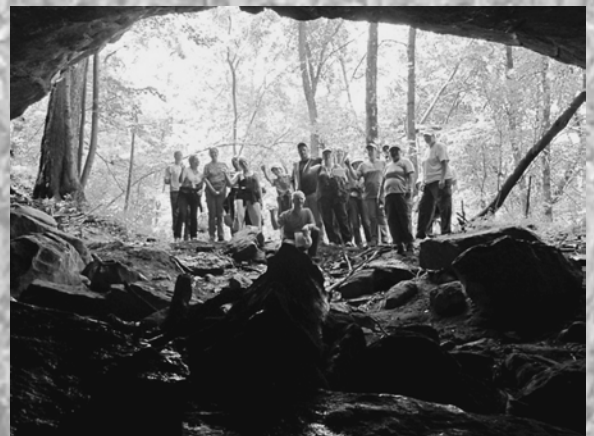
NEH Summer Scholars at the entrance to Larsen Cave.