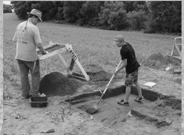
2010 Public and High School Field School in the Holmen area.

The Public Outreach Program appreciates the continuing support of MVAC members and the Board of Directors, fellow colleagues, and faculty and students from the UW-L Archaeological Studies Program.