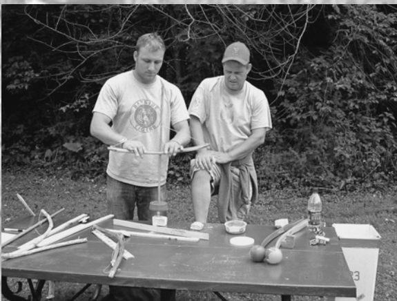
NEH Summer Scholars experiment with a pump drill.

Teachers from across the nation came to La Crosse to participate in a unique learning experience this summer. MVAC and UW-La Crosse hosted a three-week Summer Institute for Teachers titled "Exploring the Past: Archaeology in the Upper Mississippi River Valley."